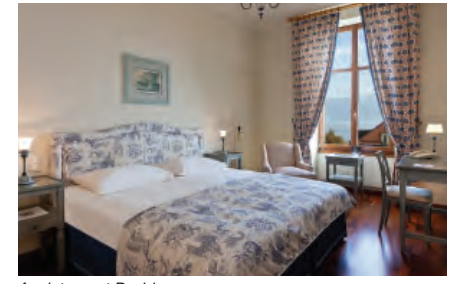
Angleterre et Residence